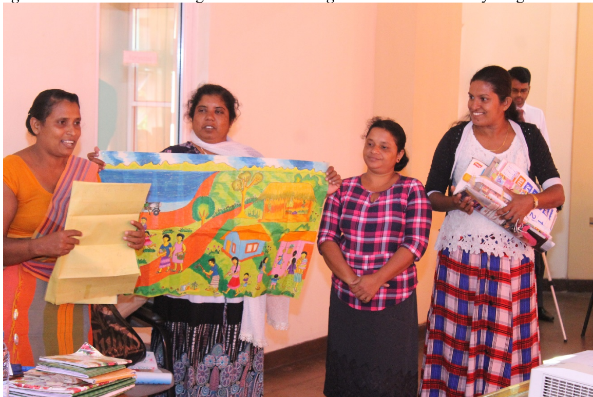
Figure 7. Lay community resource persons