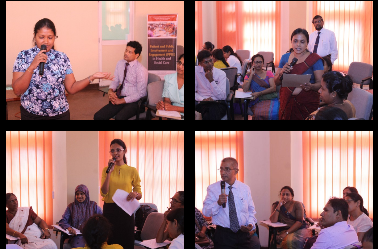
Figure 8. Small group discussion members presenting their views on the barriers & enablers of PPIE in health and social care research.