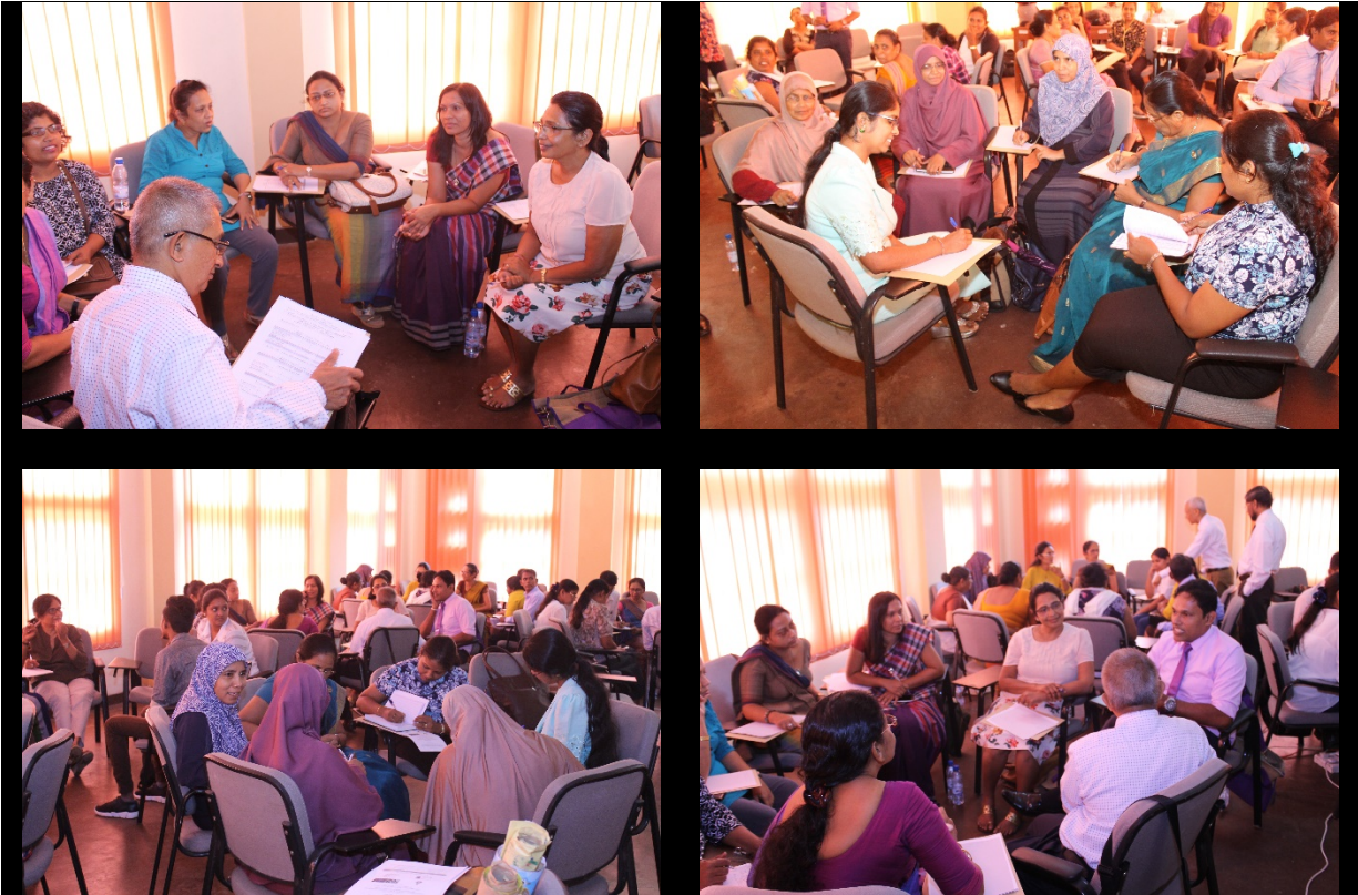
Figure 7. Small group discussions on the barriers & enablers of PPIE in health and social care research.