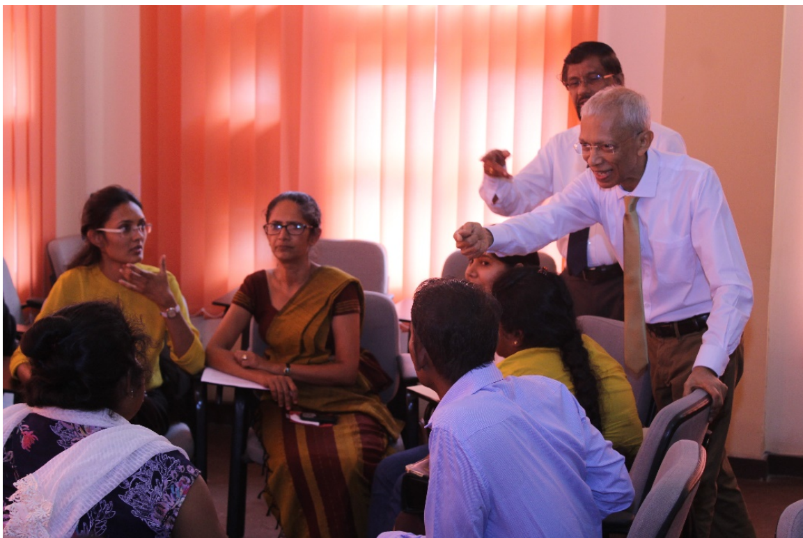
Figure 6. A participant engaging a resource person on the role and relevance of PPIE in health and social care research.

The workshop proved to be an excellent opportunity for participants to network with investigators from other institutions and community support groups, share their experiences, express their concerns and engage in discussion (Figure 6). Further instances of productive interaction are presented through the figures in Appendix 2.